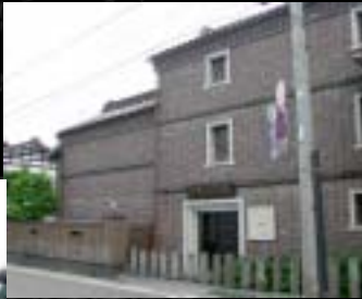
■ Sequence of “Kura-s”