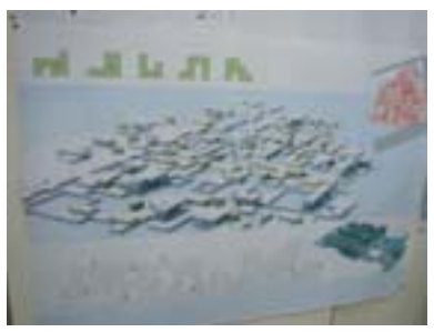
The Workshop ends at this presentation but we should think the relationship between global warming and city should be.